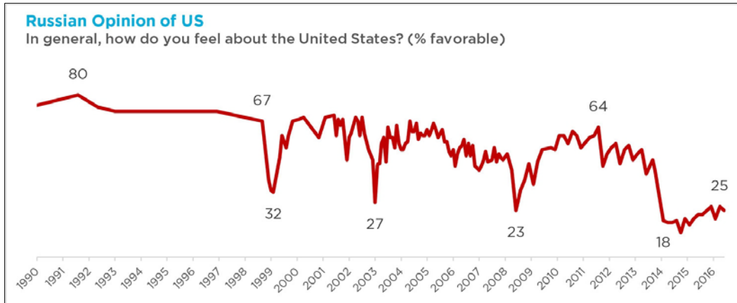
Table 1. Russian Opinion of the United States

Russians tend to blame the United States for a range of troubles, both domestic and international. Public opinion polls show that Russians consistently tend to accuse the West of fomenting so-called color revolutions in post-Soviet states and of causing the current split between Russia and Ukraine. Certainly, successful Russian state-controlled propaganda campaigns have influenced domestic perceptions about a range of international actors. In May 2016, the Levada Center conducted a survey that demonstrated a correlation between major international events (from Russia’s perspective) and public distrust toward the countries involved (see Table 2 ). Clear examples of times of high Russian public negativity toward other states were during the Euromaidan protests, the Russian-Georgian war, and the relocation of a World War II monument in Estonia (the “Bronze soldier affair”).