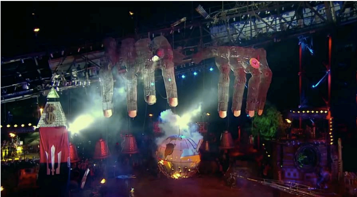
Figure 2. A Scene from the Night Wolves' "Redemption" Biker Show (2014)

A good example of anti-American imagery can be seen in the Night Wolves' 2014 show "Redemption" where the United States is portrayed as the world's evil puppet-master manipulating the strings of nations and geopolitical events. In the show, gigantic hands loom threateningly over everyone (seen Figure 2 ). Other segments show Ukraine bleeding, which is a flashback to the familiar Soviet-era cliché about the "sticky fingers of capitalism" (" zagrebushchie lapy kapitalizma ").