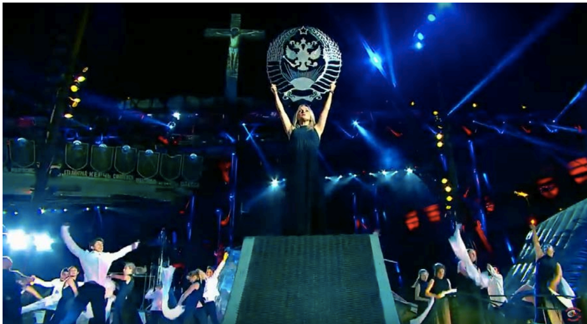
Figure 1. A Scene from the Night Wolves’ “Forge of Victory” Show (2015)

A performer holds up a modified state emblem of the Soviet Union in which the hammer and sickle are replaced by the two-headed eagle referencing the Russian Empire. There is a large Christian cross in the background.